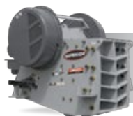
LIBERTY® JAW CRUSHER