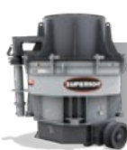
VALOR® VERTICAL SHAFT IMPACTOR