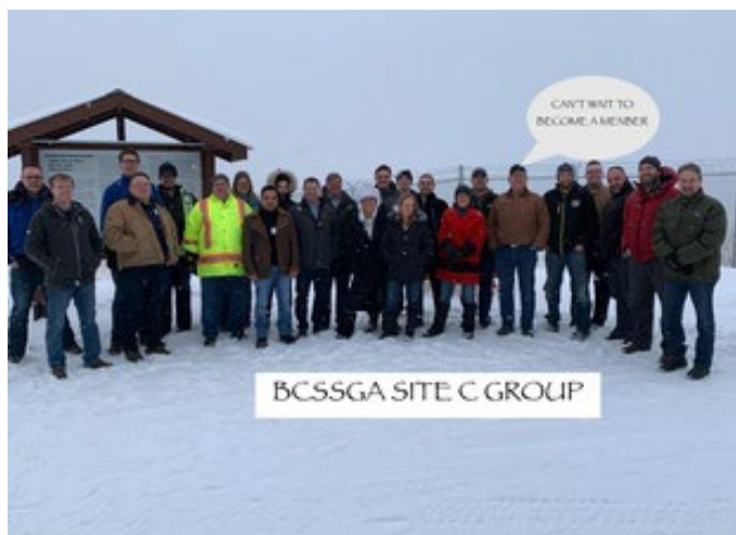
Fort Saint John meeting and Site C Tour Group