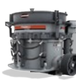
PATRIOT® CONE CRUSHER